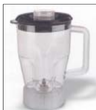
21/CAC59 2 Litre Container Polycarbonate container complete with lid and blending assembly