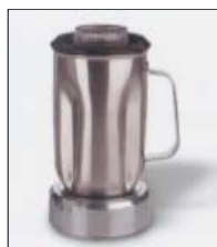
21/SS715 1 Litre Container Stainless steel container complete with polystyrene lid and blending assembly