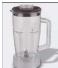
21/CAC21 1.4 Litre Container Polycarbonate container complete with lid and blending assembly