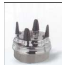
21/AD2 2 Litre Adapter Allows use of one litre and smaller containers on 2-litre motor base units