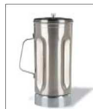
21/SS810 2 Litre Container Stainless steel container and handle with one-piece stainless steel lid with knob. Fits all 2-litre Waring motor base units